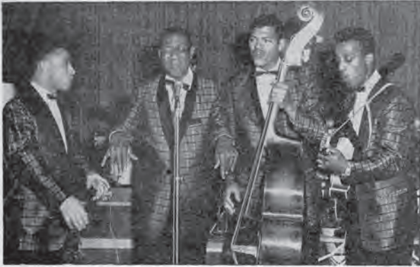
The Ink Spots, famous recording artists, as they appeared at the Harbord Barracks NCO Club.