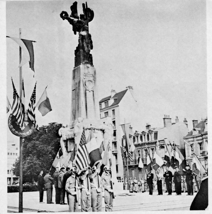
An American honor guard participates in Memorial Day ceremonies with the French Anciens Combattants (veterans) in the Place Gambetta. In the background are typical apartment houses, old and new.

All roads from Orleans lead to points of interest. Forty miles to the north is Chartres, with its famous cathedral dating back to the 11th century. The picturesque village of Beaugency, parts of its medieval wall still intact, is less than 25 miles away. About an hour's drive eastward is the Monastery of Saint Benoit, great intellectual center of the Middle Ages. And at least half a dozen of the more famous Loire valley chateaux are just a pleasant summer Sunday's excursion away. These are a must!