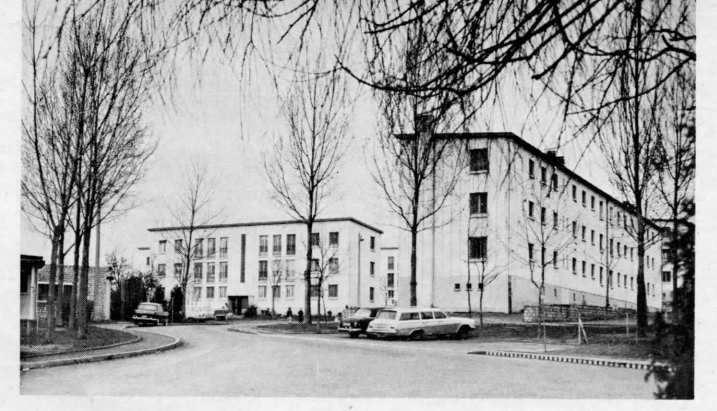
Modern government housing for the American military at St. Jean de Braye is in sharp contrast to the vintage homes and apartments of old Orleans.

France is having inflation troubles and prices keep going up, despite efforts by the French government. There is no "average" rental; costs range all the way from $60 or $70 per month for a small apartment to $150 for a large house and grounds.