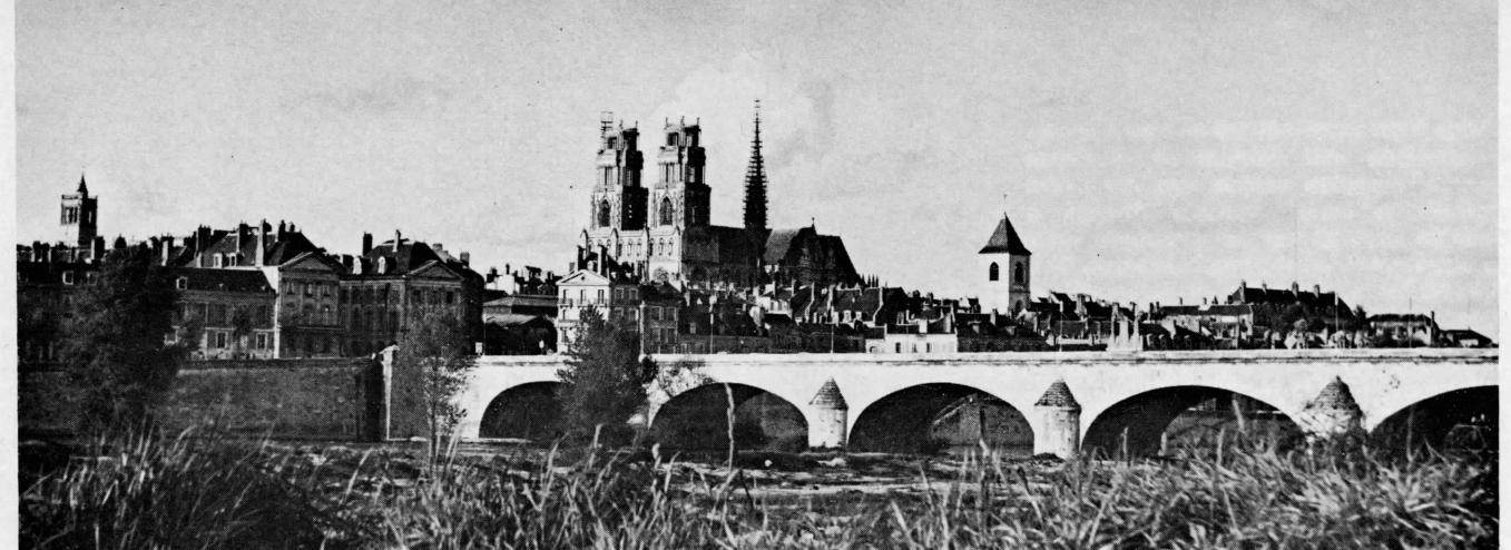
View of Orleans with the George V bridge in the foreground and the Cathedral of Sainte-Croix rising above the shops and apartment houses.