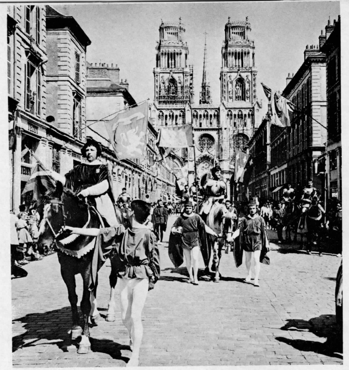
Preceded by retainers, the Orleanaise maiden chosen to be the 1964 Joan of Arc parades through the streets on her pony. The Cathedral of Sainte-Croix is in the background.